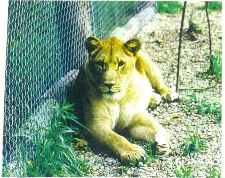
Above: Rappie, enjoying a summer day in her large enclosure.

Rappie, a female African lion, arrived at the Exotic Feline Rescue Center in December, 1996, when she was about 4 to 6 months old. We were told by the Humane Society that she was an unhandleable cub that had been seized by authorities in Lima, Ohio, where she was found tied in a wood shed. Upon arrival Rappie was underweight, malnourished, had facial lacerations, and was terrified of people. That same day she was introduced to Koshka, a three month old tiger cub, who immediately became her best friend. Rappie now enjoys a large enclosure with her friend where she loves to rearrange the spools and eliminate trees. She frequently seeks attention from our volunteers and visitors.