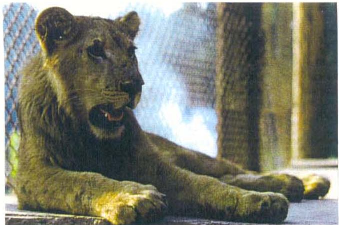
Below: The young male lion enjoying his new home.

Our newest resident, (pictured below) a young male lion arrived in August from Missouri. He was seized in a drug raid in April 1998 and spent the past few months living at a veterinary clinic near Springfield, Missouri. This young lion, who is about 1 year old, is extremely friendly with people, but is very shy with the other lions. Hopefully, he will realize that he too has four legs and fur and will begin to identify with his new pride (Wedge, Rake, Lea, Nala, and Gabby).